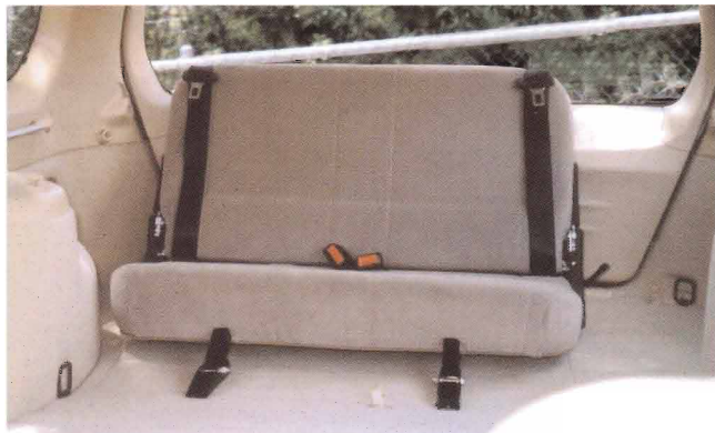
Eco 2 child seat in a Subaru Forester