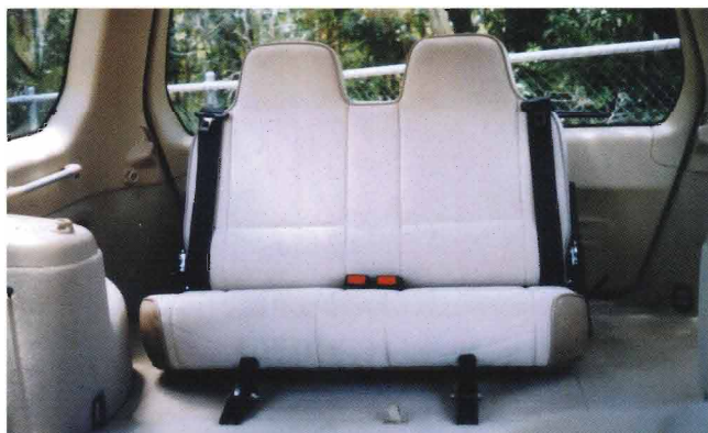
Add 2 child seat in a Subaru Forester