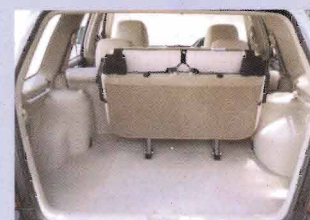
Rear view - seat folded forward. Folded seat takes up 300mm.