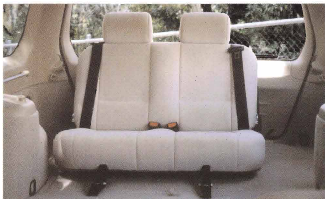
Take 2 Classic child seat in a Subaru Forester