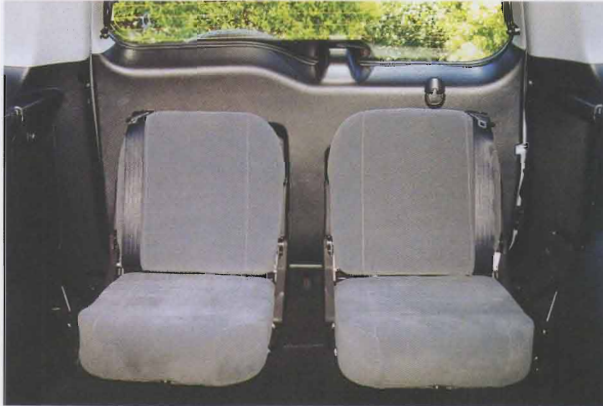
Eco 1 with Retractable Belts