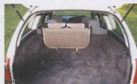
Rear View - seat folded forward