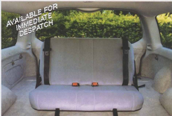
Eco 2 with Retractable Belts